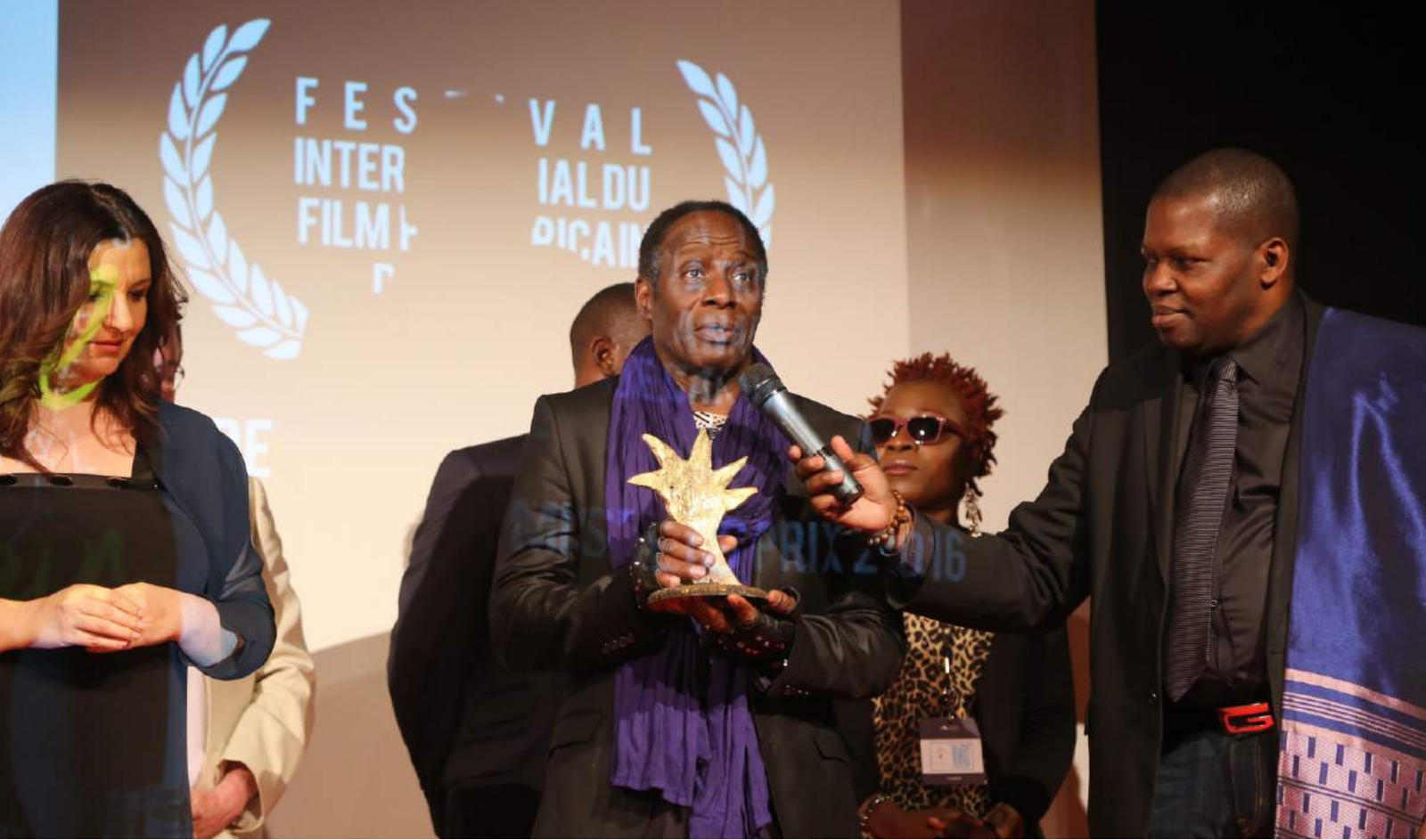
Sidiki Bakaba Receiving his Dikalo Award