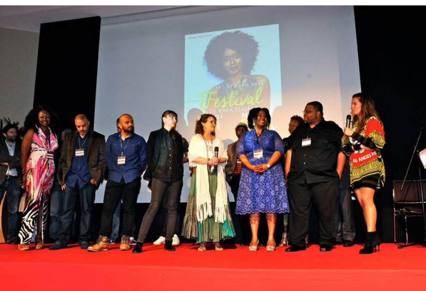
Presentation of Film Directors & Producers